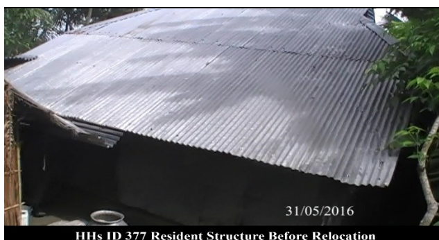
HHs ID 377 Resident Structure Before Relocation