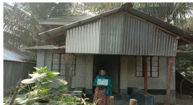
HHs ID 21 Resident Structure After Relocation