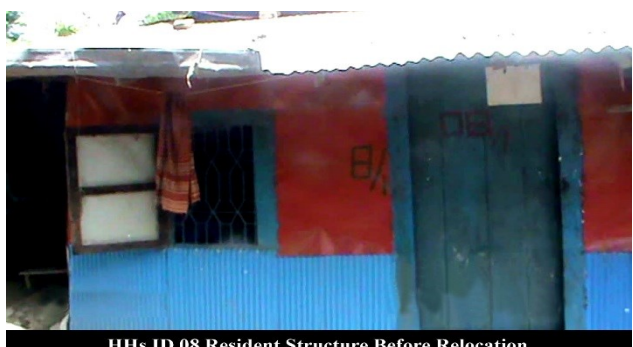
HHs ID 08 Resident Structure Before Relocation