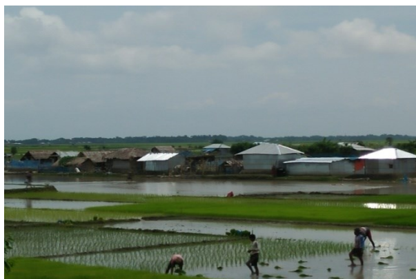
Photo 9: Group Relocation site: Chunkuri (Dangapara) CEIP-1 Resettlement Village under Polder-33