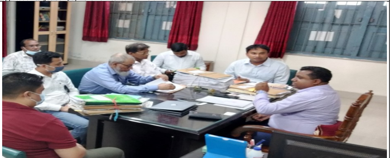
Photo 4: Meeting with ADC (Revenue and LAO), Patuakhali in presence of WB Team & PMU officials regarding to LA issues and payment of CUL of Polder-43/2C, 47/2 & 48.