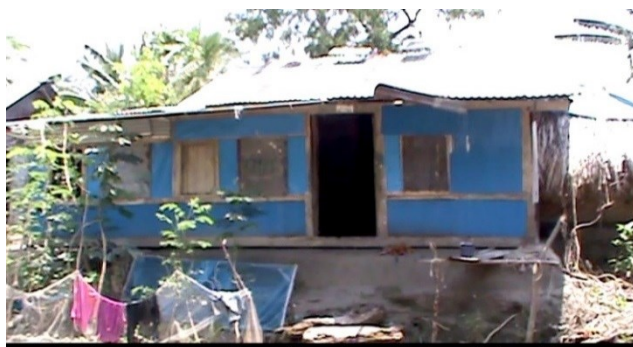
HHs ID 771 Resident Structure Before Relocation