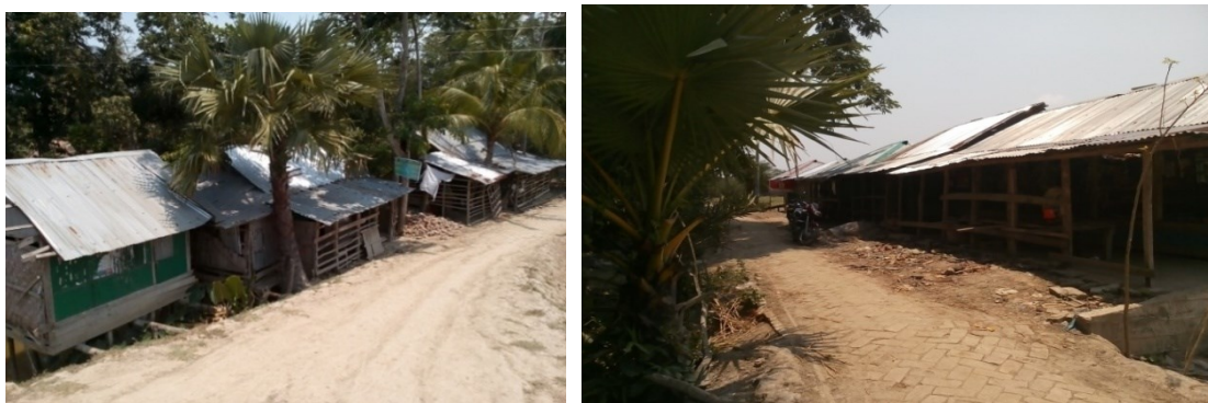
Photo 14: Market Relocation for Anando Bazar, Razapur at Polder 35/1