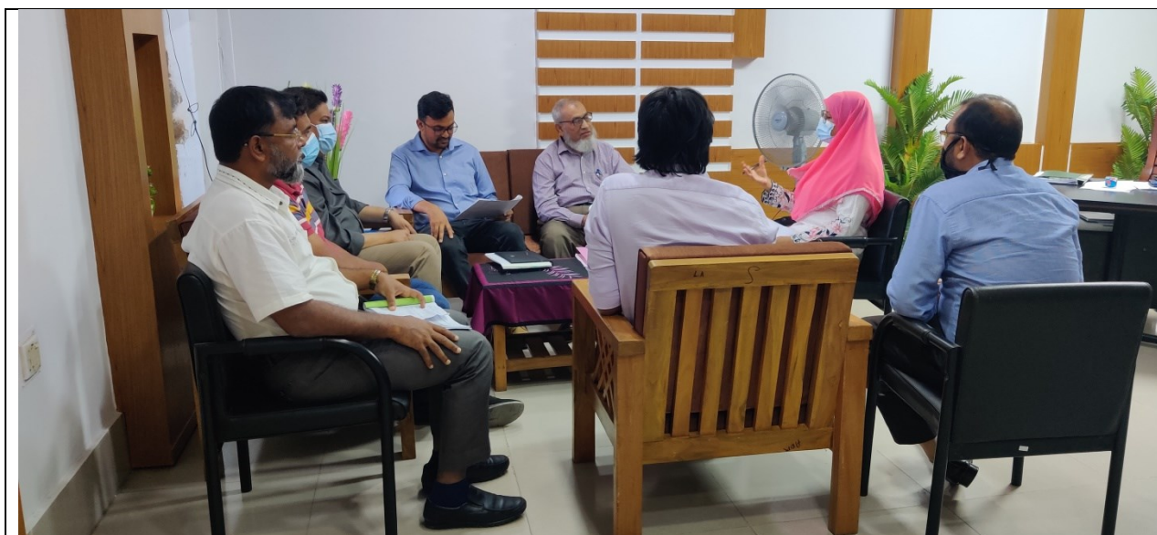
Photo 6: Meeting with ADC, Khulna in presence of WB & PMU officials regarding expedite the CUL payment of Polder-32 & 33.