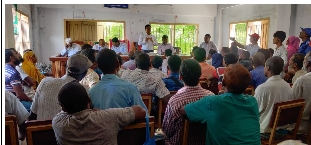
Photo 7: Consultation Meeting with titled land owner at Suterkhali UP of Polder-32 in presence of DC officials.