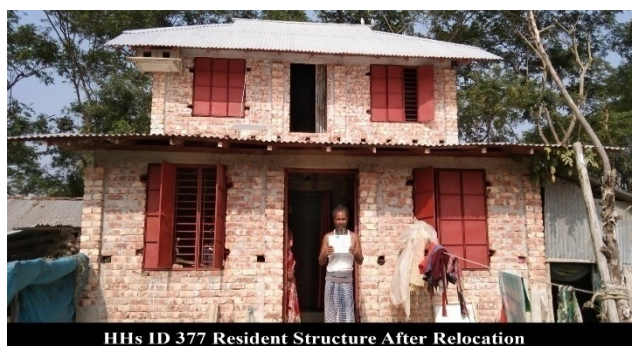
HHs ID 377 Resident Structure After Relocation