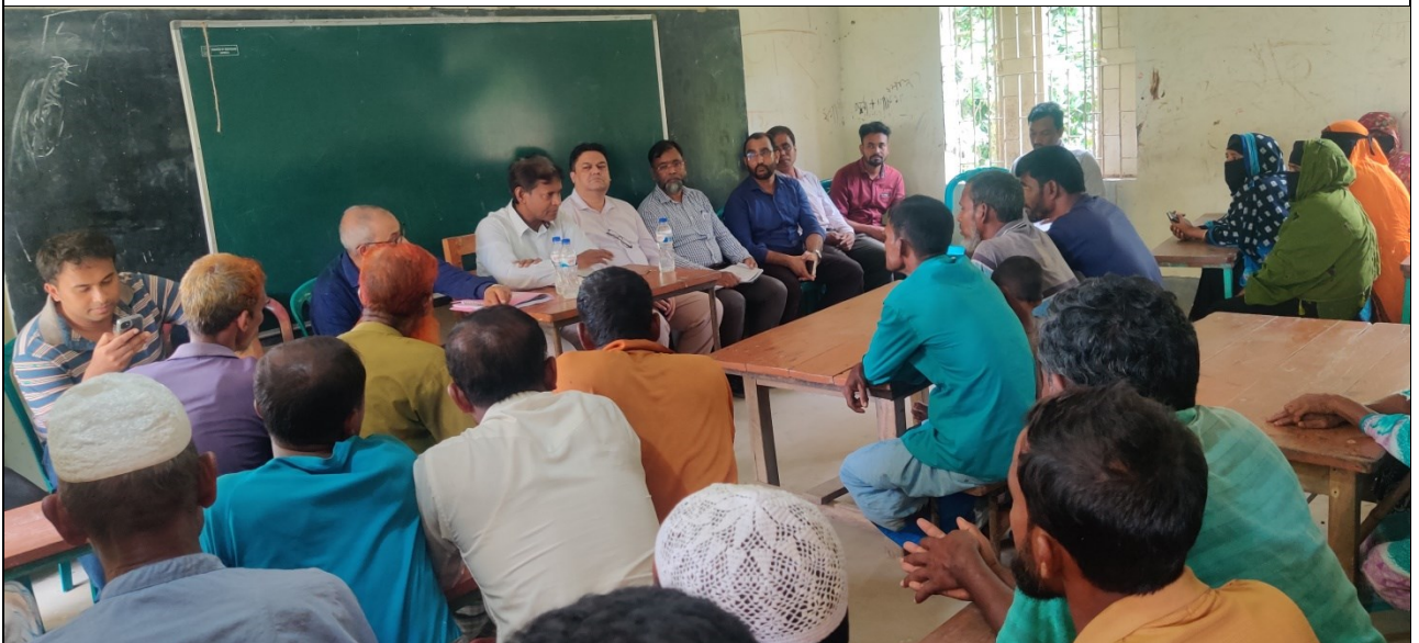
Photo 16: Meeting with relocated Squatters (Group Relocation) at Dakhin Charduani of Polder-40/2 in presence of WB Team & PMU officials.