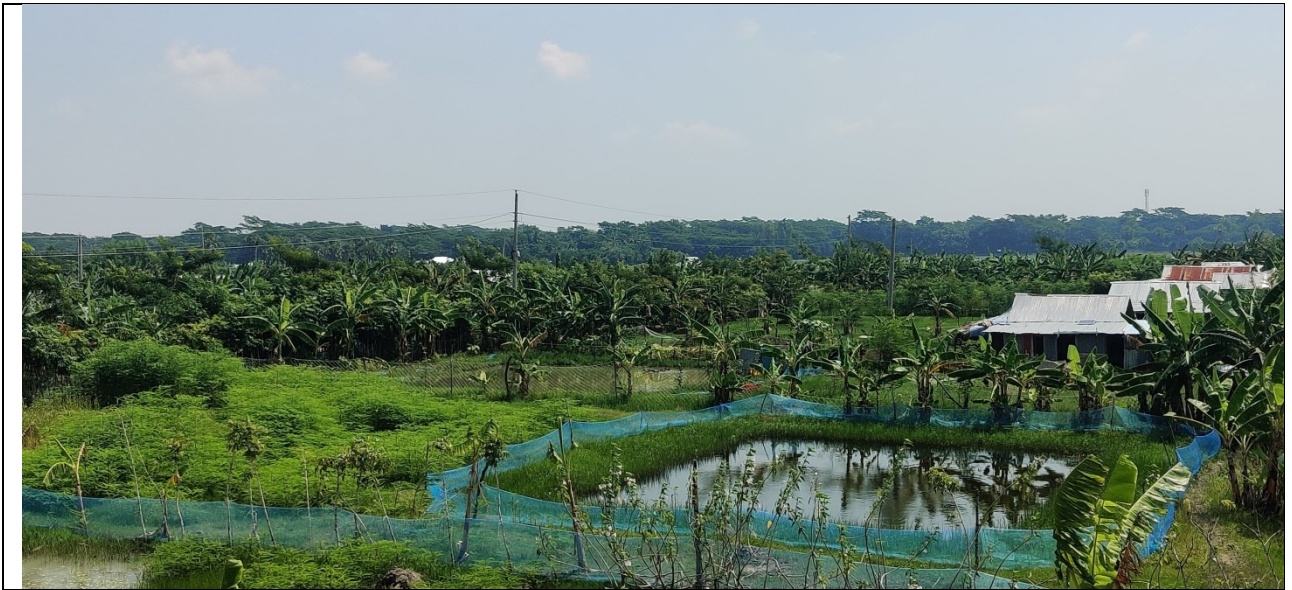
Photo 15: Group relocation site of Dhakin Charduani of Polder-40/2