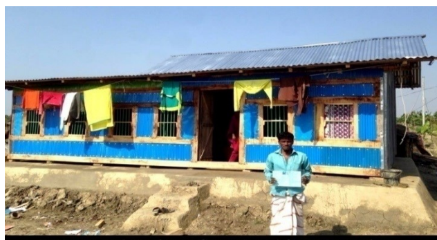
HHs ID 771 Resident Structure After Relocation