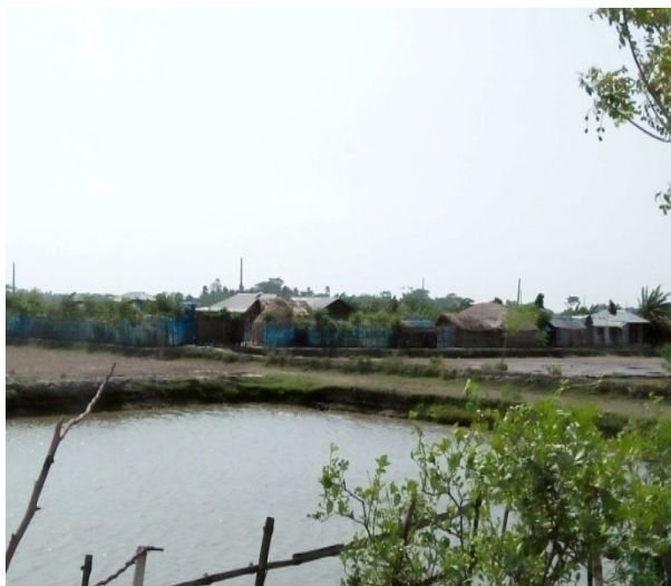
Photo 8: Group Relocation site: Meeting at CEIP Village, Uttar Kamarkhola under Polder-32