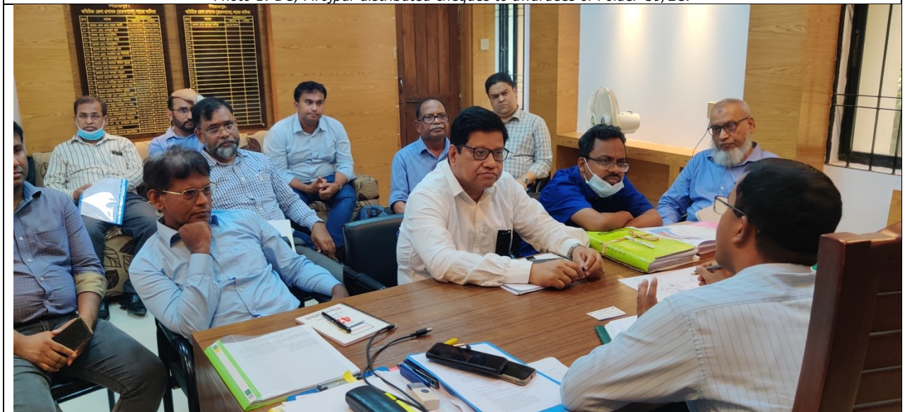
Photo 2: Meeting with ADC & LAO, Pirojpur in presence of PD, CEIP-1, WB Team, regarding to expedite the CUL payment of Polder-39/2C.