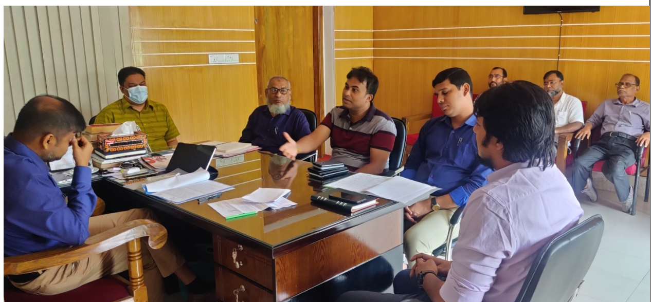
Photo 5: Meeting with ADC & LAO, Jhalakati in presence of WB Team & PMU officials regarding to expedite the CUL payment of Polder-39/2C (Jhalakathi District).