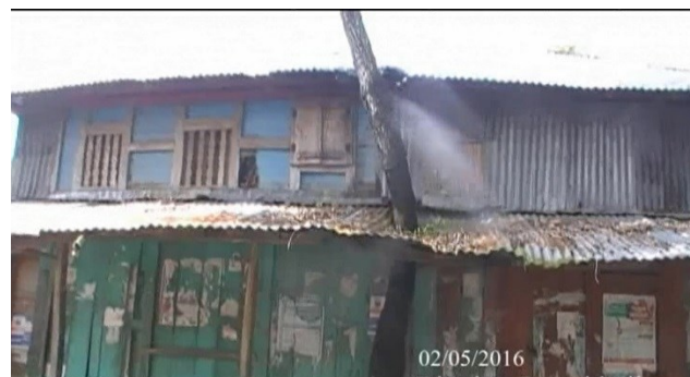
HHs ID 21 Resident Structure Before Relocation