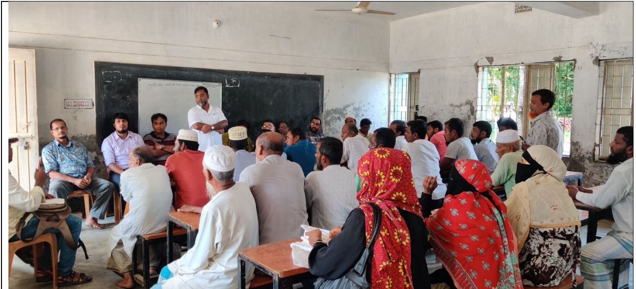
Photo 3: Meeting with awardees at Choto-Shewla mouza of Polder-39/2C in presence of WB Team & PMU officials for submission of application to get CUL payment from concerned DC office.