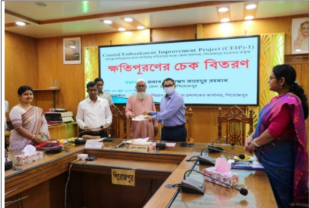
Photo 1: DC, Pirojpur distributed cheques to awardees of Polder-39/2C.