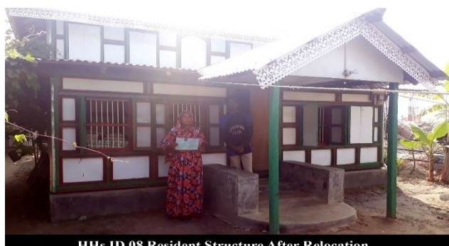
HHs ID 08 Resident Structure After Relocation