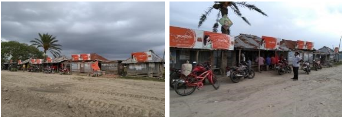
Photo 12: Relocation site at Mollikerber Madrasha Bazar in Polder-35/3

they are provided. It is also evident that the compensation for structure has been adequately assessed and affected people are apparently satisfied with the compensation amount they get. Business owners are encouraged for relocating their business concerns in a cluster market at the locations nearby of the affected market. The following photographs show the new market locations.